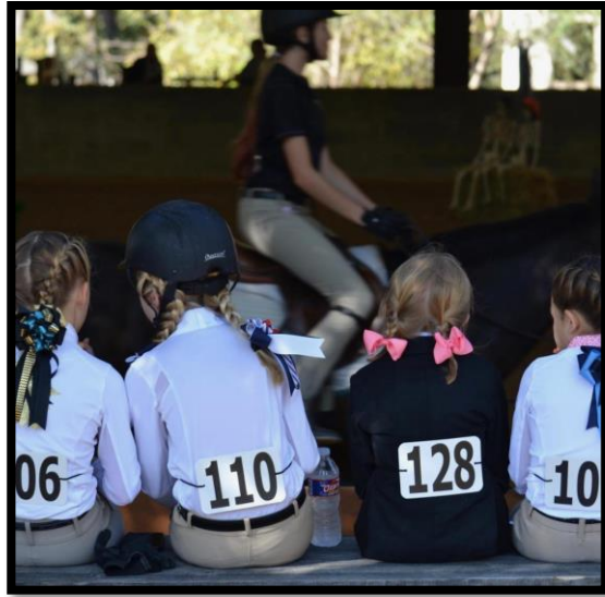
Now that's a barn family! Always cheering for our friends!