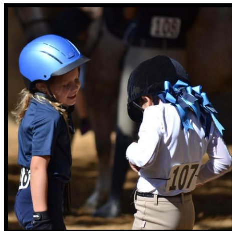
Riders getting ready to show off their SKILLS!